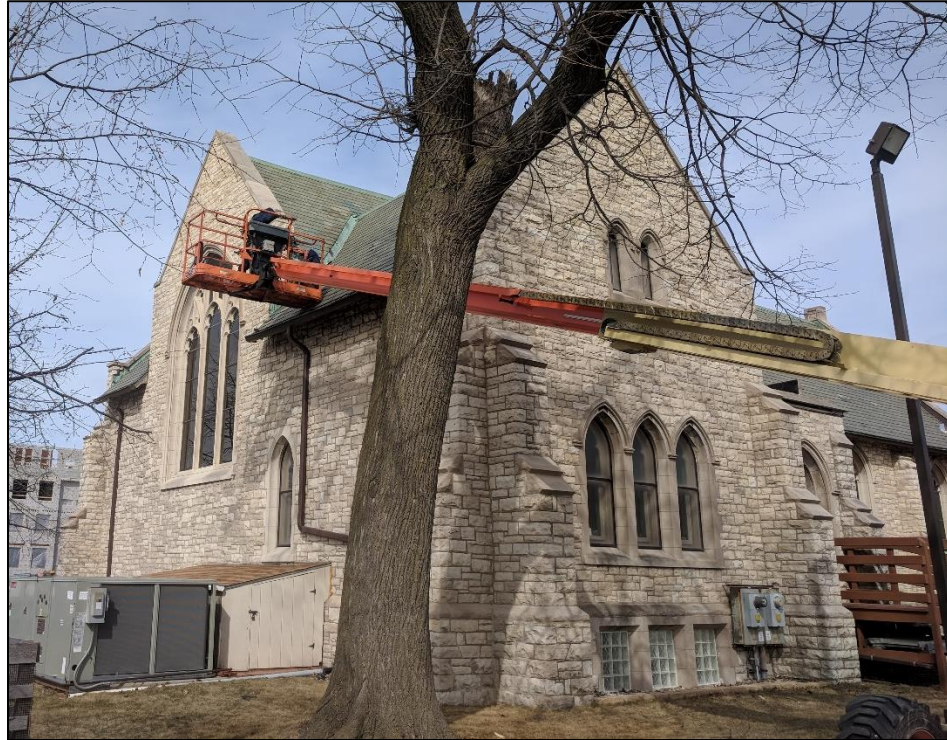
Roof repairs 2018