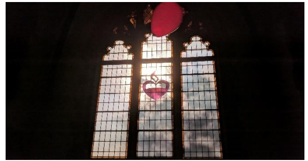
Balloon blessing all-ages service 2017