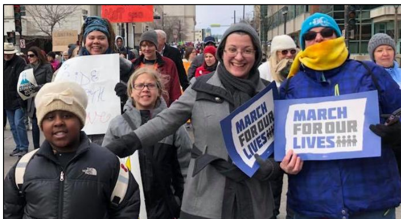
Bradford UU members and youth at March for Our Lives Milwaukee

The SCC made a recommendation to the BLM task group that the congregation adopt a resolution about the Black Lives Matter movement and that the congregation have a vote on the wording of a banner and also be given the choice of no banner. In a special congregational meeting there were 8 votes for the Black Lives Matter banner and 18 votes for a more inclusive banner and 20 votes against having the banner. The task group is to continue and a report of the task group is included in this annual report.