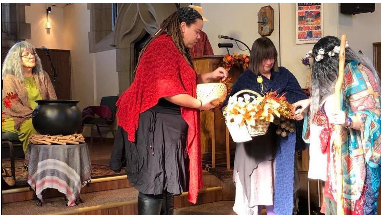
Time for all-ages story from Halloween service 2017