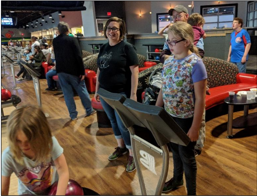
RE Bowling Party - 2018