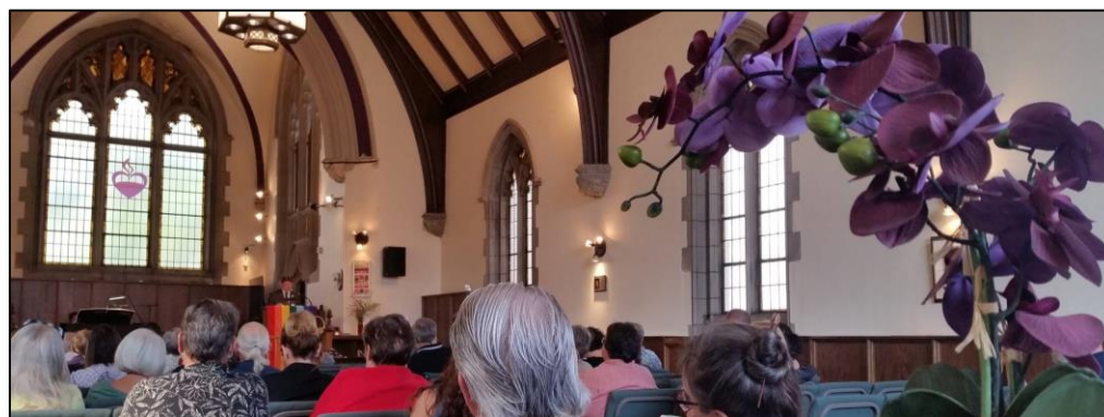
Sunday Service, 2017