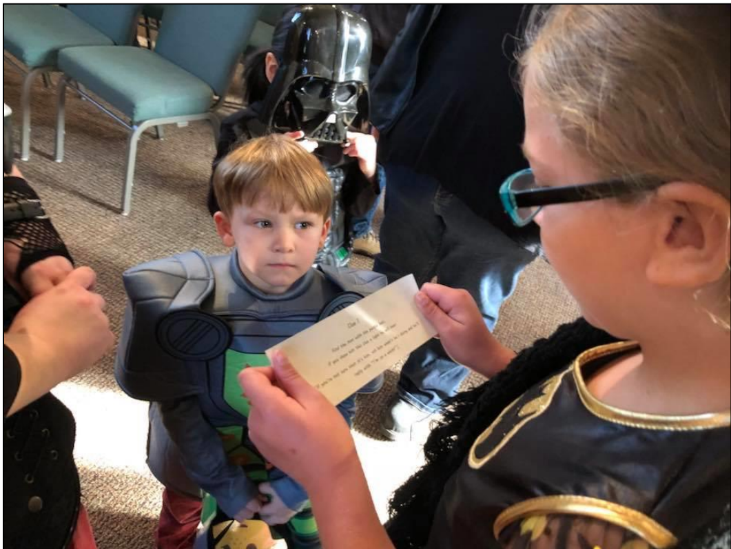
The Halloween trick-or-treat scavenger hunt is on!