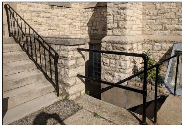
Front and side entryway railing installation and repair