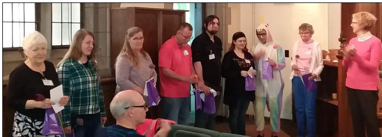
New Member Ceremony, May 2018