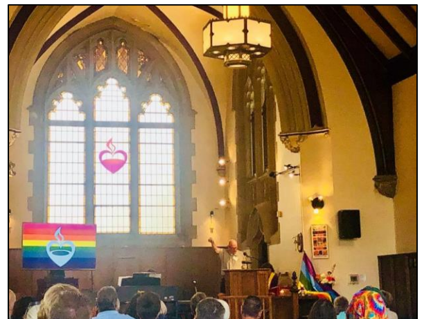
Flat-screen TV during Pride service 2018

The finalized proposal will be the subject of an upcoming capital campaign to purchase, install and calibrate the system.